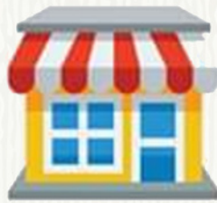
Stall Shops & Malls