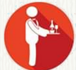
Café & Restaurants